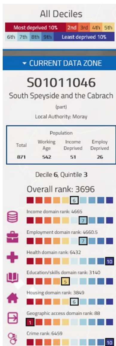
Table 2. SIMD 2020 Ranking - South Speyside and Cabrach

The Scottish Index of Multiple Deprivation (SIMD) is a measure of deprivation across 6,976 data zones. SIMD ranks data zones from most deprived (ranked as 1) to least deprived (ranked as 6,976) and the Inveravon data zone (South Speyside and Cabrach) is ranked at 3696. Within this ranking geographical access is the biggest level of deprivation, followed by Education/Skills. Income and Employment are relatively good while Crime and Health are ranked as the least deprived. A graphical breakdown of this information is below.