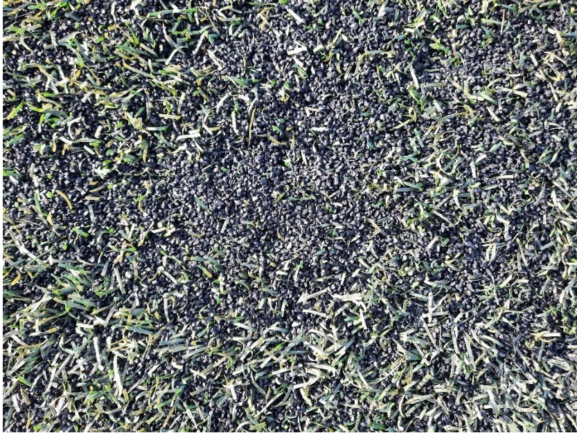
Figure 1 – Worn Yarn at Speyside