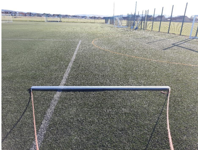
Figure 2: Deviation at Buckie High School