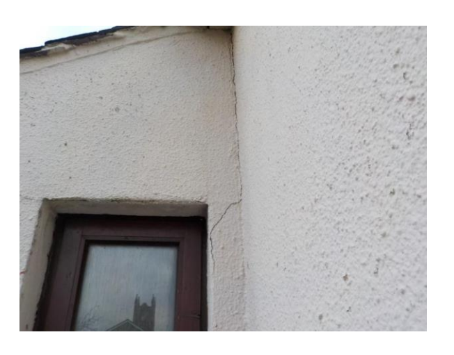
Cracking of side extension east end.