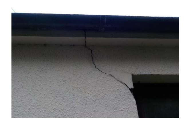
Cracking to west end.