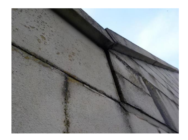
Lateral movement southeast side.