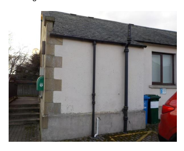
External view of sagging roof.