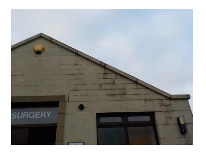
Open joints northeast side.