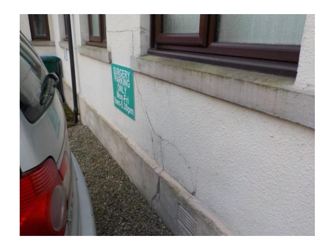
Cracking to west end.