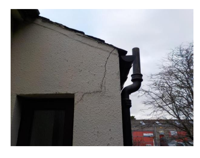
Cracking of side extension east end.