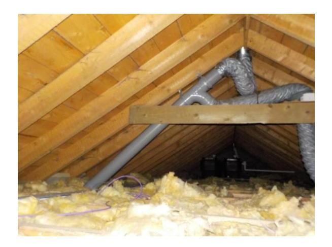
Internal view of roof structure.