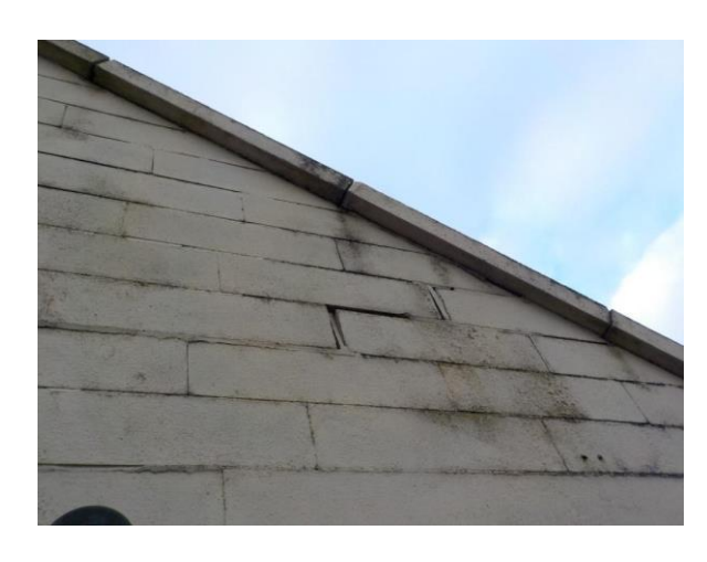
Open joints northeast side.