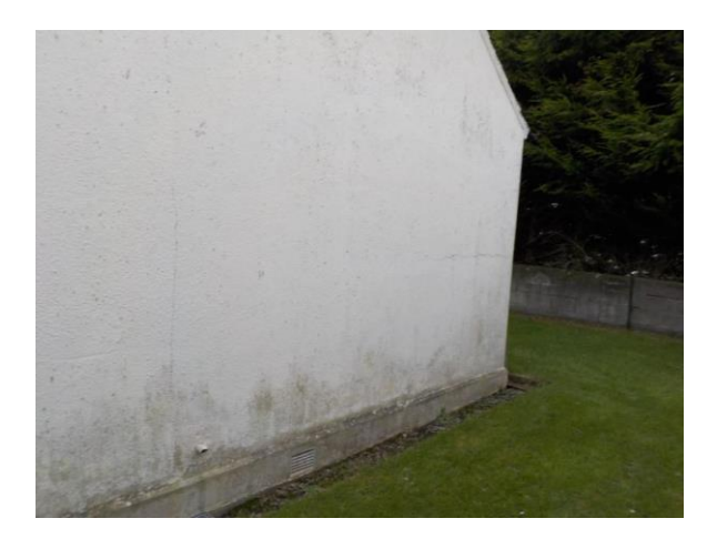
West gable elevation.