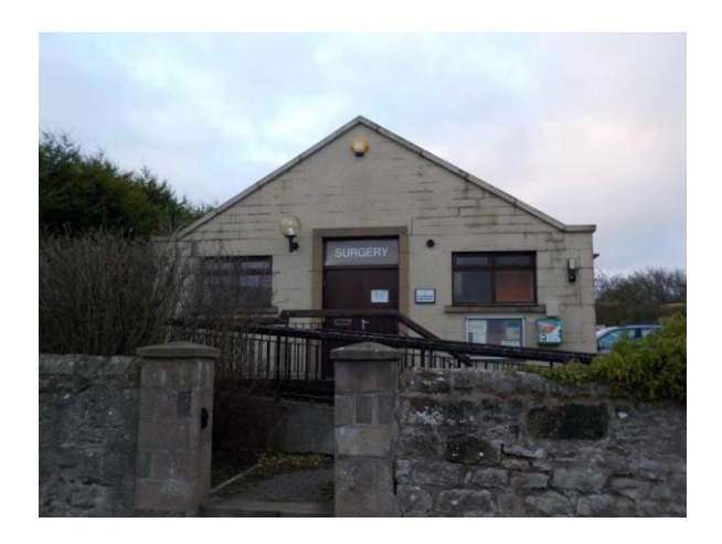
East entrance gable.