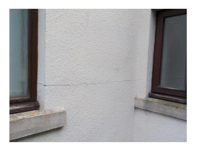
Cracking to east end.