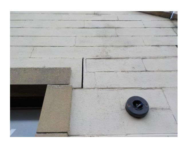
Open joints northeast side.