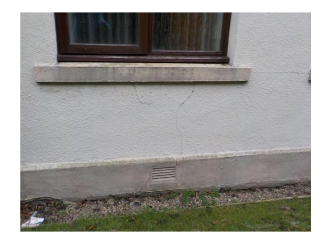
Cracking to south elevation.