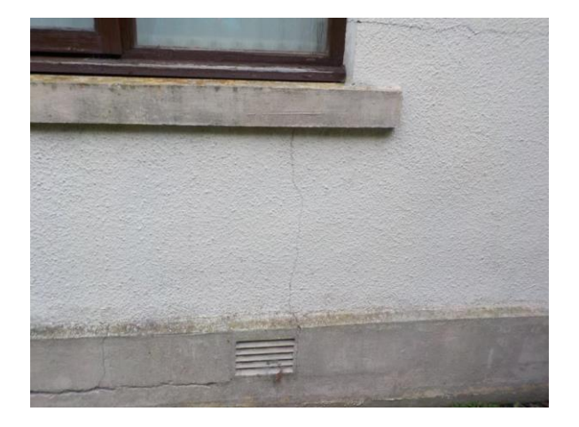
Cracking to south elevation.