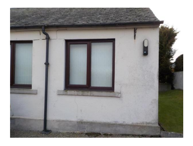
Cracking to west end.