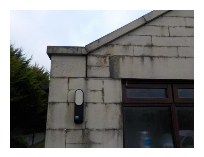
Open joints southeast side.