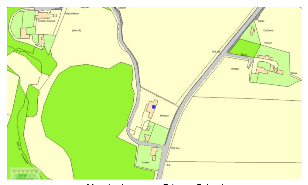
Map 1 – Inveravon Primary School

Inveravon Primary School has a functional capacity of 50 pupils. It is a single storey building with two classrooms, kitchen, hall, resources room, library reception/staff room. The hall doubles as both a dining room and indoor PE area. The school floorplan is attached as Appendix B and a map of the school ground and its surrounding amenities is shown in Map 1 below.