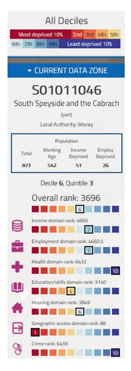
Table 2. SIMD 2020 Ranking - South Speyside and Cabrach

The Scottish Index of Multiple Deprivation (SIMD) is a measure of deprivation across 6,976 data zones. SIMD ranks data zones from most deprived (ranked as 1) to least deprived (ranked as 6,976) and the Inveravon data zone (South Speyside and Cabrach) is ranked at 3696. Within this ranking geographical access is the biggest level of deprivation, followed by Education/Skills. Income and Employment are relatively good while Crime and Health are ranked as the least deprived. A graphical breakdown of this information is below.