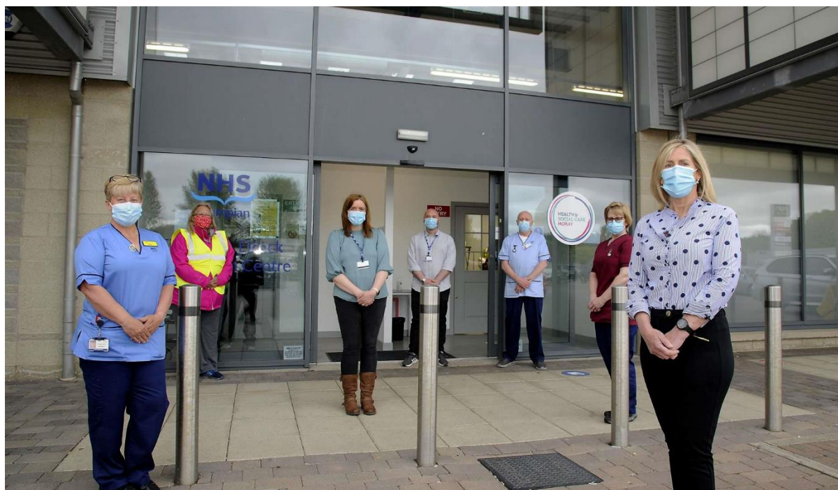
Staff at the opening of the Fiona Elcock Vaccination Centre

The vaccine programme was accelerated in response to the increase in positive Covid 19 tests in early 2021, and the vaccination team stepped up immediately to offer all adults their first vaccine, which completed on the 20 th May.