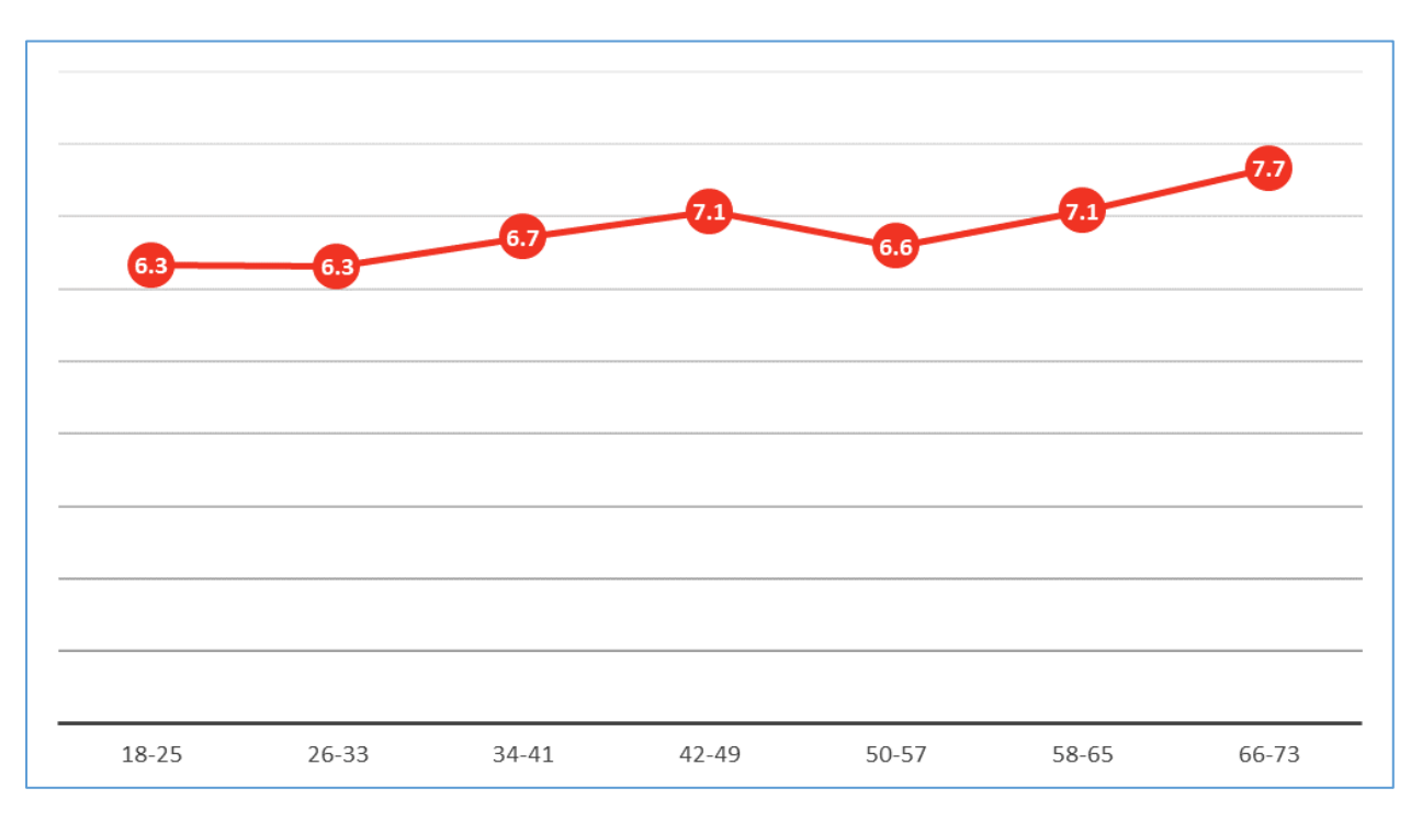
Figure 2 Average of Initial Assessment by Age Group