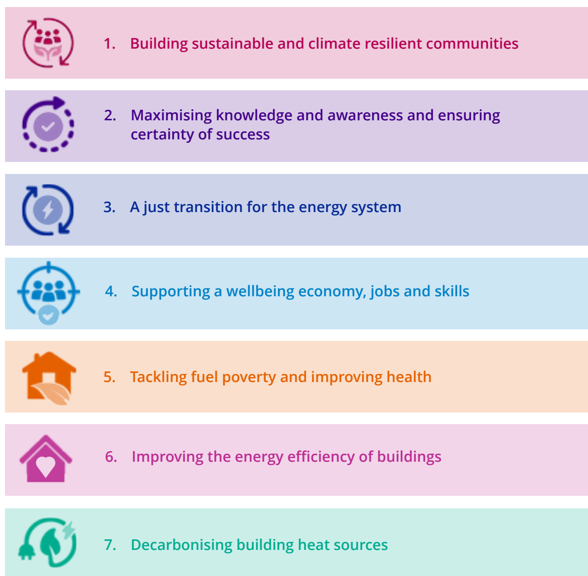
Table 1. LHEES priorities for Moray.

It has been developed in collaboration with key stakeholders to ensure a cohesive and considered approach to action across Moray. Actions have been defined across three timescales: immediate (within 6 months), short term (6 months to 2 years) and long term (2-5 years).