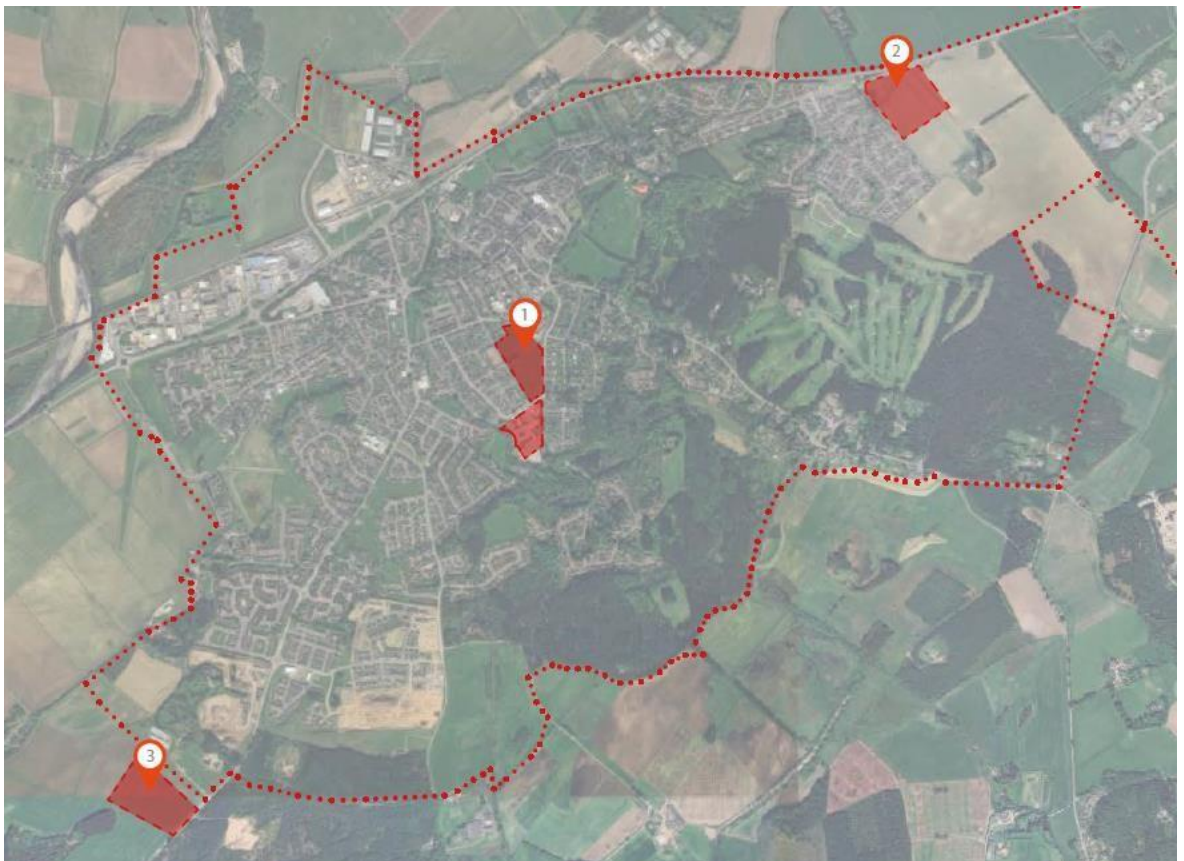
Figure 1. Potential locations for Future Forres Academy