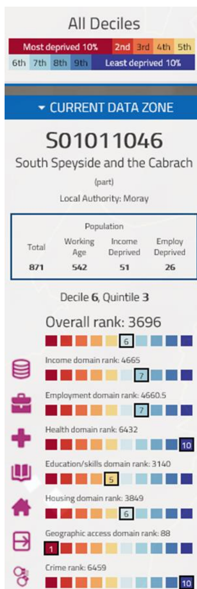
Table 2. SIMD 2020 Ranking - South Speyside and Cabrach

The Scottish Index of Multiple Deprivation (SIMD) is a measure of deprivation across 6,976 data zones. SIMD ranks data zones from most deprived (ranked as 1) to least deprived (ranked as 6,976) and the Inveravon data zone (South Speyside and Cabrach) is ranked at 3696. Within this ranking geographical access is the biggest level of deprivation, followed by Education/Skills. Income and Employment are relatively good while Crime and Health are ranked as the least deprived. A graphical breakdown of this information is below.