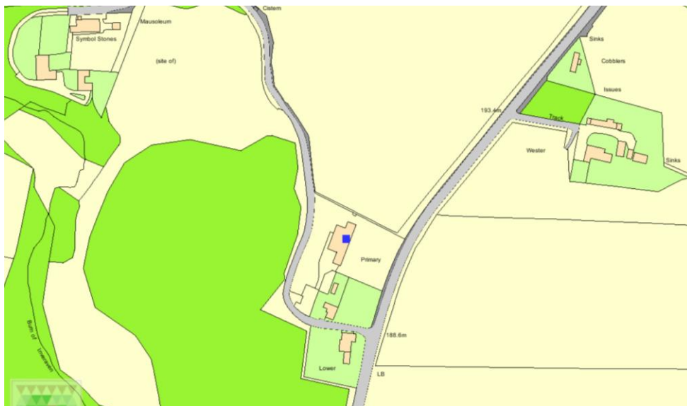
Map 1 – Inveravon Primary School

Inveravon Primary School has a functional capacity of 50 pupils. It is a single storey building with two classrooms, kitchen, hall, resources room, library reception/staff room. The hall doubles as both a dining room and indoor PE area. The school floorplan is attached as Appendix B and a map of the school ground and its surrounding amenities is shown in Map 1 below.