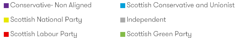
MORAY COUNCIL MEMBERSHIP