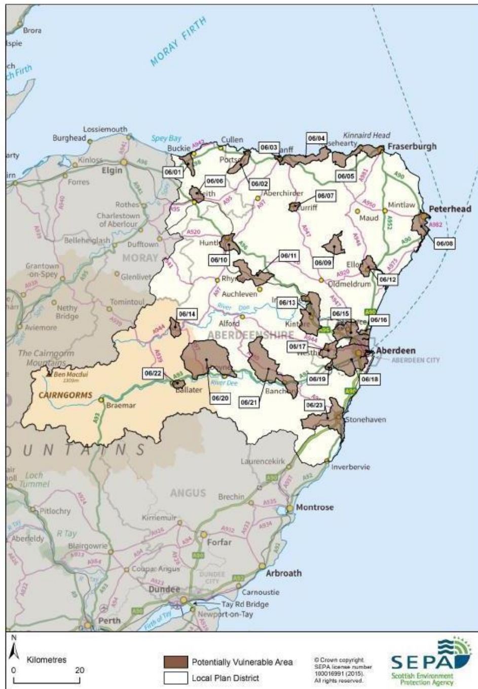
Figure 1: The North East Local Plan District with Potentially Vulnerable Areas identified

There are actions that apply across the whole of the NELPD and actions that are specific to each of the 23 Potentially Vulnerable Areas (as defined under Section 13 of the Act) in the North East LPD, which are shown below in Figure 1.