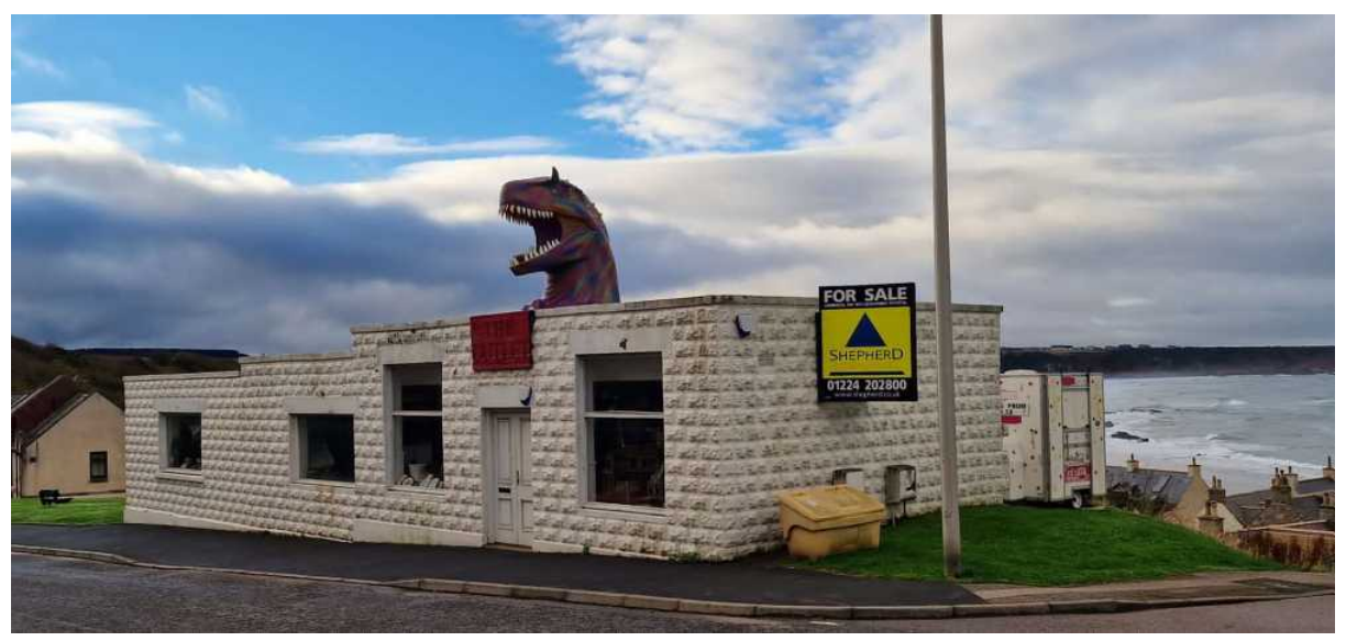
View of dinosaur head on roof of 1 Bayview Road, Cullen from the southeast

The proposal seeks retrospective planning permission for a dinosaur head on the roof of 1 Bayview Road, Cullen. The premises currently operates as an antique business with a wide variety of interesting artefacts from all over the world. The dinosaur head reflects this unique offering, itself being for sale.