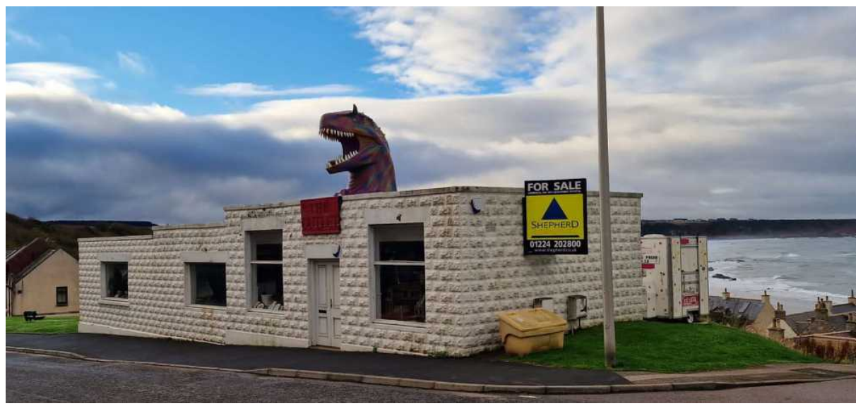
View of dinosaur head on roof of 1 Bayview Road, Cullen from the southeast

The proposal seeks retrospective planning permission for a dinosaur head on the roof of 1 Bayview Road, Cullen. The premises currently operates as an antique business with a wide variety of interesting artefacts from all over the world. The dinosaur head reflects this unique offering, itself being for sale.